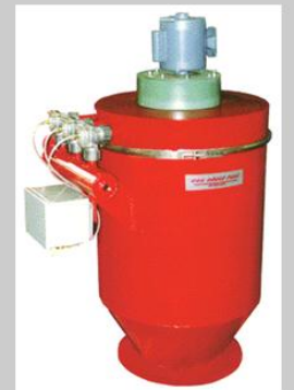
ROUND COMPACT BIN VENT

FOR MORE INFORMATION ON OUR PRODUCTS AND SERVICES VISIT OUR WEBSITE AT: