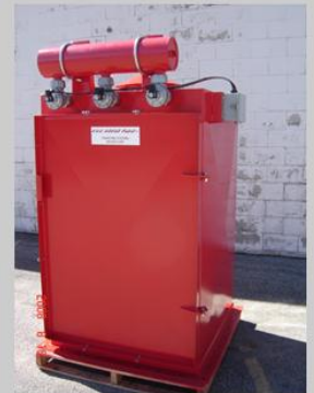
SQUARE COMPACT BIN VENT