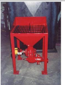
ELBO FLO CONVEYOR

Contact our experienced sales staff to help design your next pneumatic conveying project